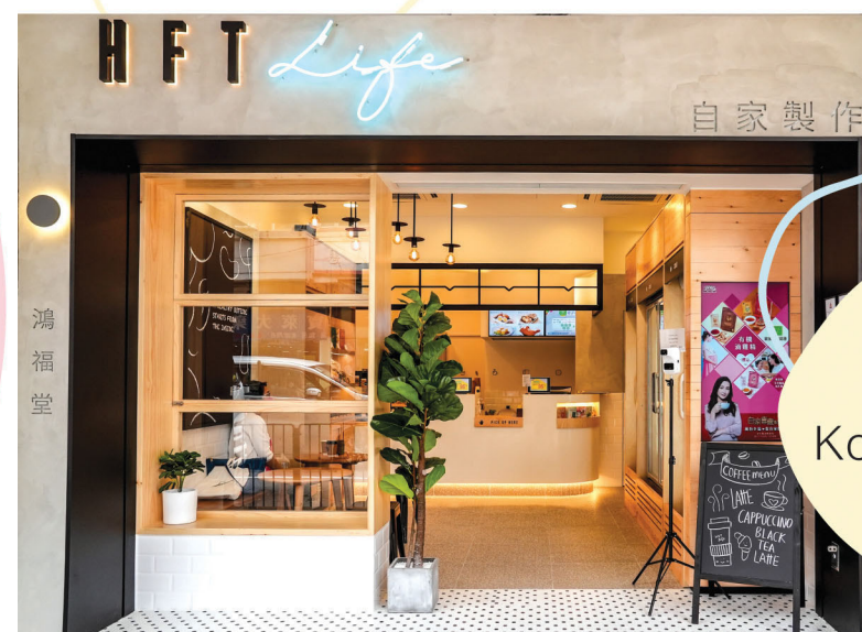
九龍城 Kowloon City