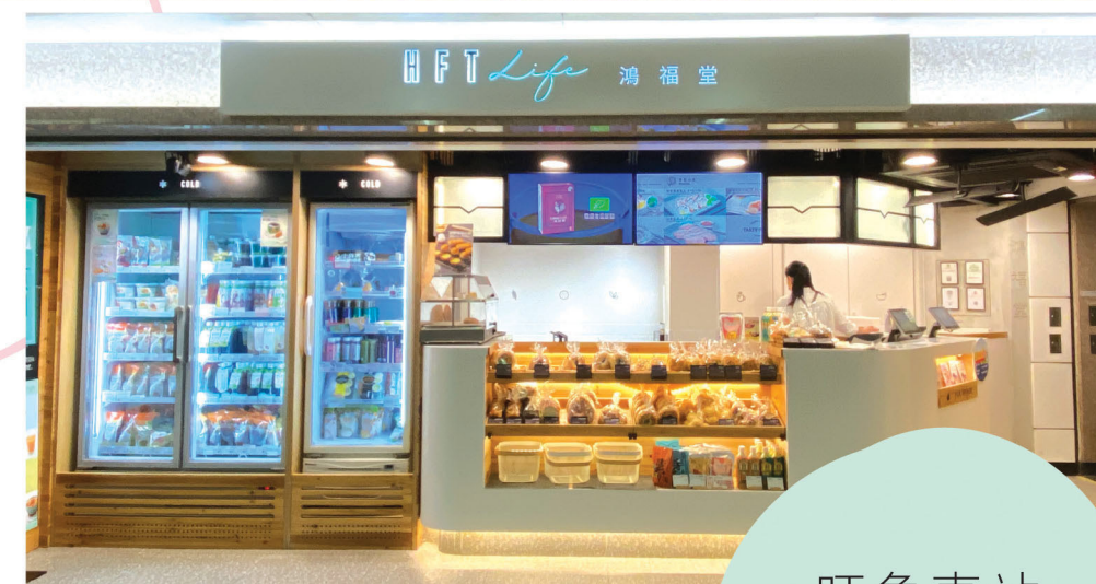
旺角東站 Mong Kok East MTR Station