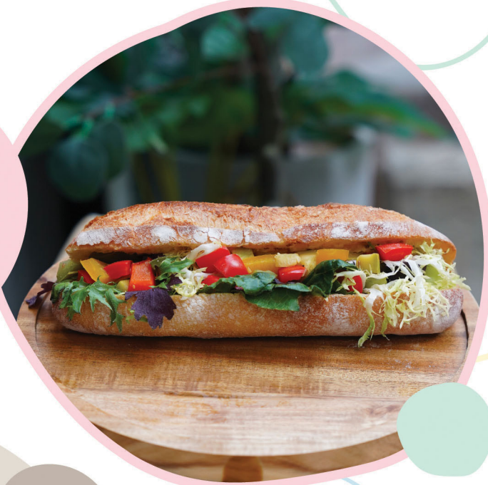
精選三文治 及麵包 Handmade Sandwiches and Bread