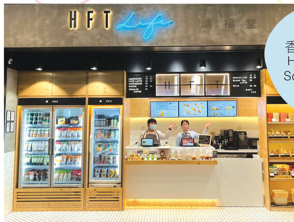
香港科學園 Hong Kong Science Park