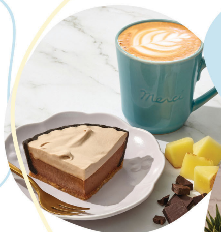
精選套餐 Featured Combos

Innovation is always the top priority of Hung Fook Tong. We are committed to bringing you different culinary experience by introducing new products.