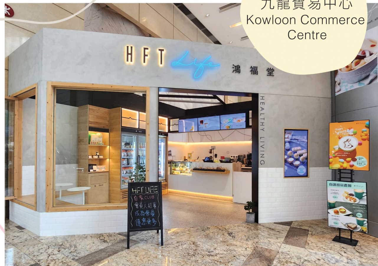
九龍貿易中心 Kowloon Commerce Centre